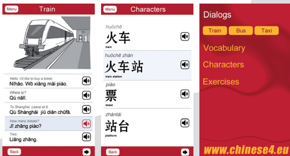
Screenshots of mobile phone application C4EU

Our mobile phone product (application) is especially designed for tourists and it will play the role of the language guide during their stay in China. You will be able to learn Chinese during your flight, bus or train journey, when staying at a hotel or in a restaurant. Attractive games and exercises will help you to improve your knowledge of Chinese. If you have problems to speak Chinese or