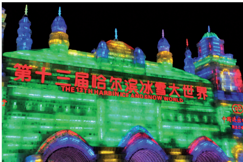
Entrance gate to Harbin ice and snow festival

ing of ancient culture of one of the oldest countries on the earth.