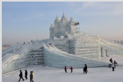
Day and night in Harbin

system which is used to transcribe Chinese characters into Latin script.