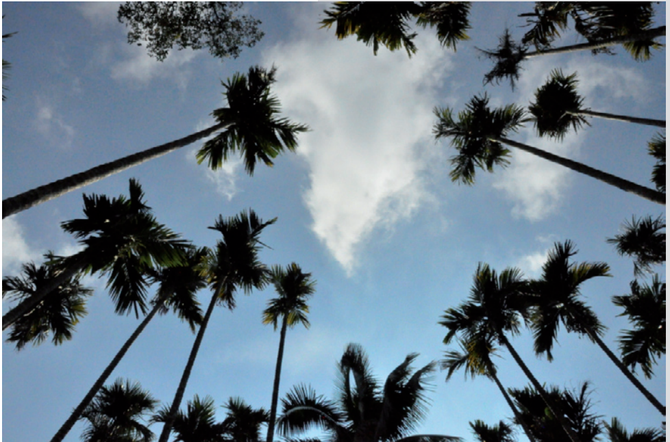
Sky high palms in Hainan

Snow Sculpture Festival you may need some hours in plane to get to Hainan Island the smallest province of People's Republic of China. The Island is called "Hawaii of the Orient" it is extremely popular holiday resort with not only Chinese but also other neighbour countries. During the past years the Chinese government has been very heavily investing in the area to make it more popular, especially among tourists from EU and USA by promoting it as world class resort filled with lots of attractions among which golf played one of the key roles.